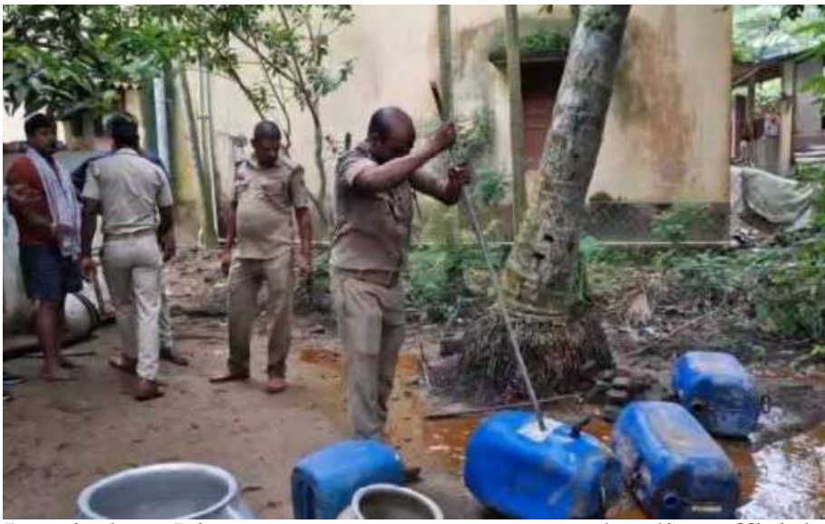
Jagatsinghpur, Jajpur, Cuttack, Bhadrak and Balasore districts in late night. A country liquor trader

Petchella, Barkandha, Teragaon, Jadupur, Nilachal Bazar, Tikhiri, Badakula, Karanj, Alailo, Ortaghata, Ostarhata, Bijaynagar as well as in areas under Gahirmatha marine sanctuary in this block. Country liquor prepared by mixing a wild root 'Bakhra' with fermented rice brew is easily available at `20 to `30 per packet. After preparation, country liquor is packed and sealed into polythene pouches and then in cartons and large plastic jars. Later, those are transported outside to