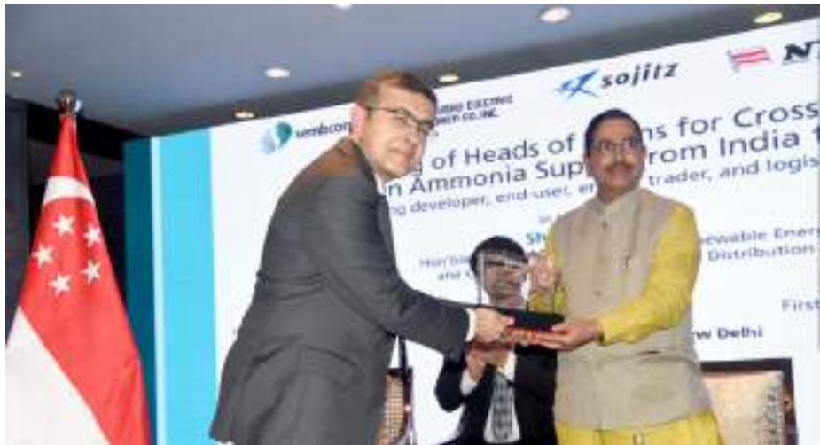
The Union Minister for Consumer Affairs, Food and Public Distribution & New and Renewable Energy, Shri Pralhad Joshi attends the signing ceremony of the first-ever agreement for the export of Green Ammonia from India to Japan, in New Delhi

institute. The BSDS program spans four years and offers an Honours degree. Additionally, students have the option to extend their studies for a fifth year to earn an integrated Master's Degree in Statistical Data Science. An exit option is also available after the third year, allowing students to graduate with a Bachelor of Statistical Data Science degree. With this new program, ISI reaffirms its dedication to fostering excellence in education and research, preparing students to meet the evolving demands of the data science field and beyond.