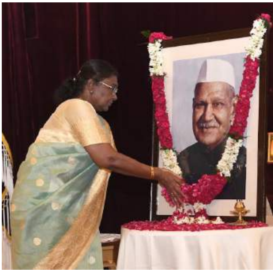
The President of India, Smt Droupadi Murmu paid floral tributes to Dr Shanker Dayal Sharma, former President of India, on his birth anniversary at Rashtrapati Bhavan today