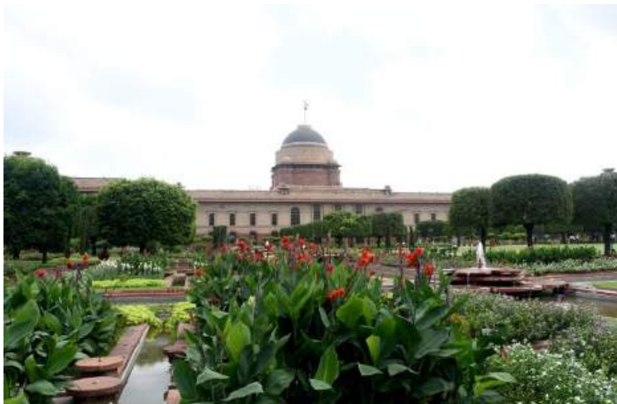
Amrit Udyan is gearing up to welcome the visitors! Glimpses of the preparation!

of our Constitution". A bench of Justice SB Pardiwala and Ujjal Bhuyan made a similar observation last month in an unrelated UAPA accused's bail hearing. They said the right to life and personal liberty, as enshrined under Article 21, is "overarching" and statutory restrictions may be overruled in such cases.