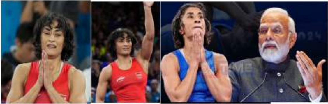
Overweight disqualification devastated Vinesh Phogat before final. PM Narendra Modi consoles the wrestler with words of encouragement

TV & Radio Cricket Commentator C/O Manish Chaturvedi 50 Dubois Street, Stamford, CT -06905 USA