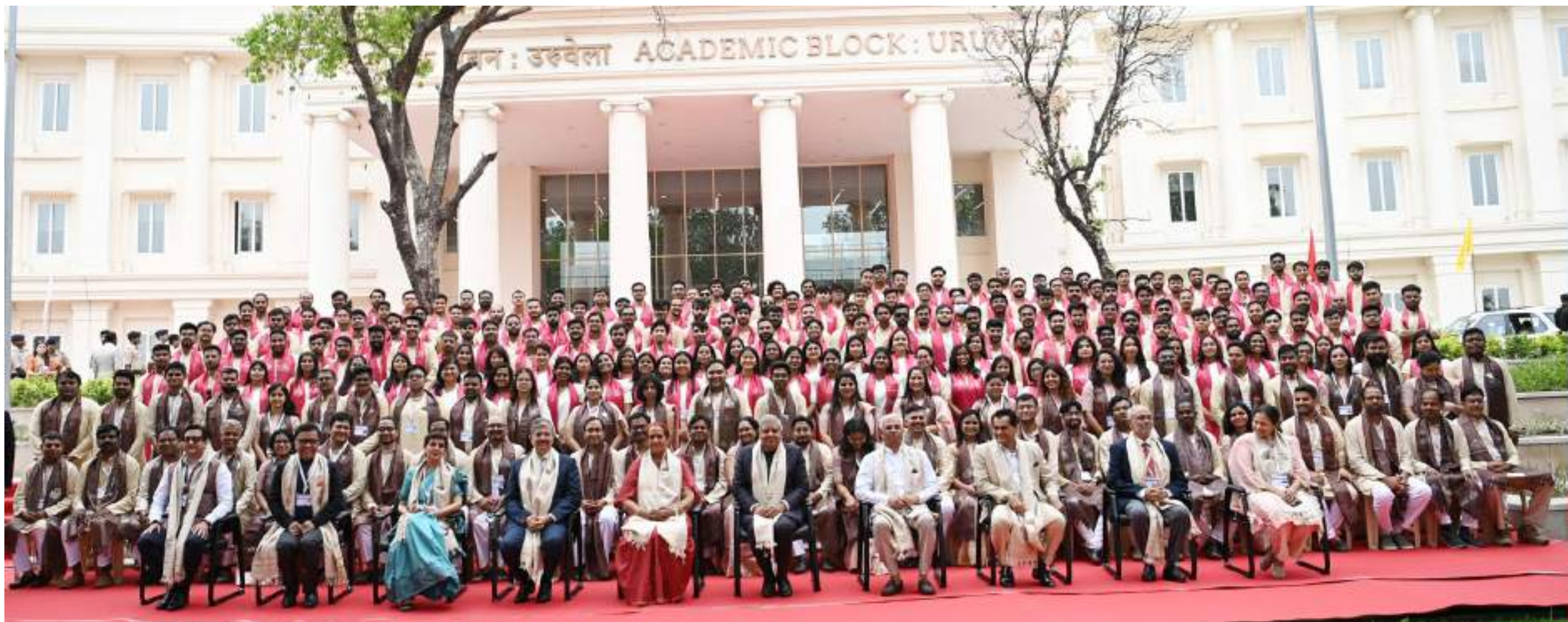
The Vice President, Shri Jagdeep Dhankhar at the 6th Convocation of IIM Bodh Gaya in Gaya, Bihar