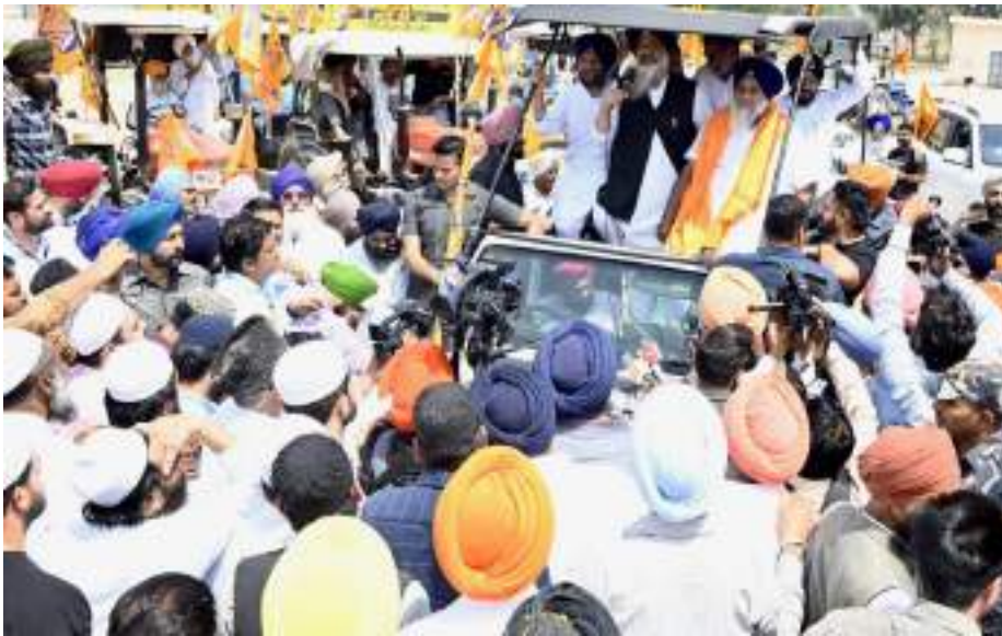
The time has come to rid the State of all centrist parties".

"Saada Punjab, Asin Punjab de" besides being presented with a memento of an 'Udta Baaj' by the youth contingent, said "both the Congress and the Aam Aadmi Party (AAP) have looted you. Both these parties have used the resources of Punjab for their national goals. They have failed to carry out any development or even establish one big infrastructure project. They have persecuted the youth who are asking for jobs and presided over the collapse of law and order and flight of capital from Punjab to other States.