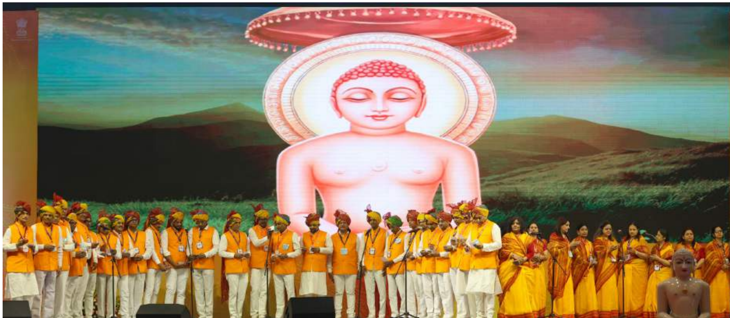
M witnessed the cultural performance and dance drama presentation during the Commemoration of 2550th Bhagwan Mahaveer Nirvan Mahotsav on the auspicious occasion of Mahaveer Jayanti at Bharat Mandapam, in New Delhi