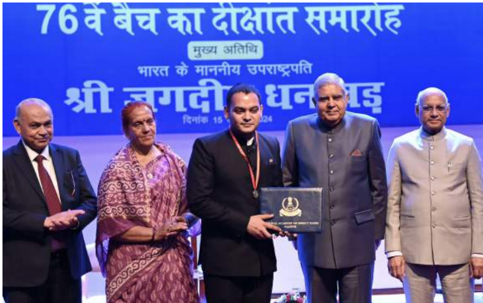
The Vice President of India and Chairman, Rajya Sabha, Shri Jagdeep Dhankhar at the Valedictory Ceremony of the 76th Batch of the Indian Revenue Service at the National Academy of Direct Taxes (NADT) in Nagpur, Maharashtra