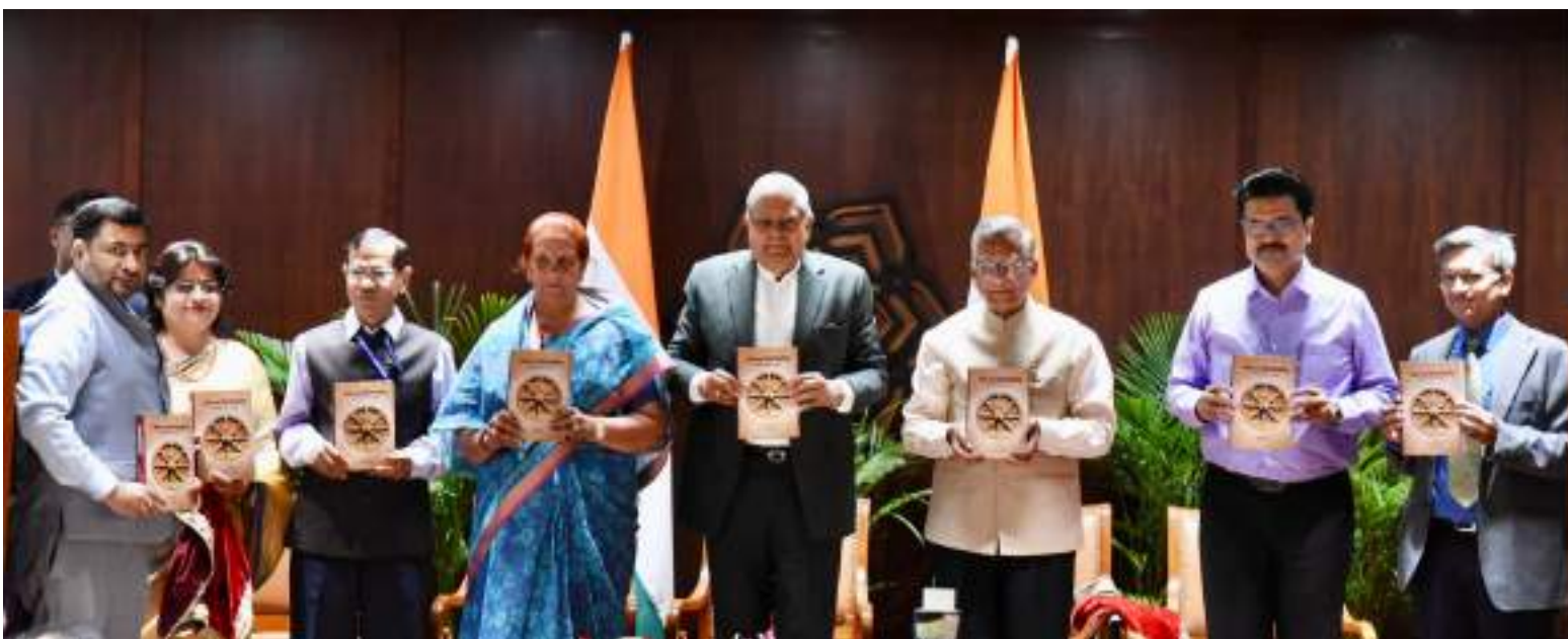
The Vice President, Shri Jagdeep Dhankhar releasing the book "Law & Spirituality: Reconnecting the Bond" at Vice-President's Enclave, in New Delhi

In Raiganj Parliamentary Constituency of Uttar Dinajpur district, Kaliaganj comprises the highest number of female electors. Here, the number is 14,24,70. In the Balurghat Parliamentary Constituency, the number of female voters is maximum in Itahar Assembly Constituency. Here, the number is 11,72,41.